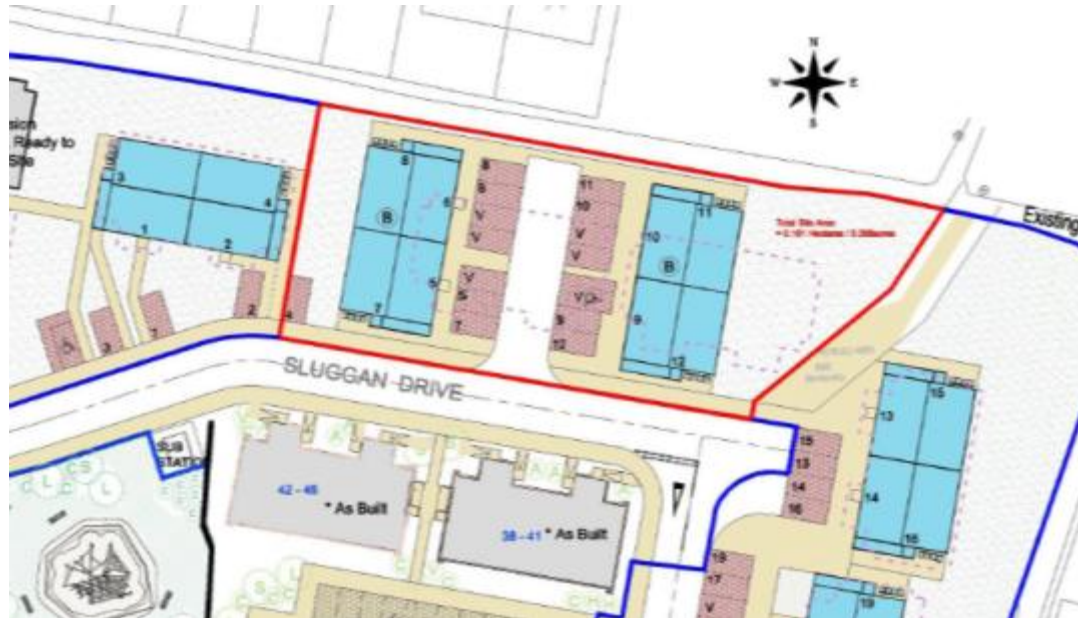
Figure 3: Proposed Layout Plan (Extract from Drawing No PL 002 Rev A for information only)